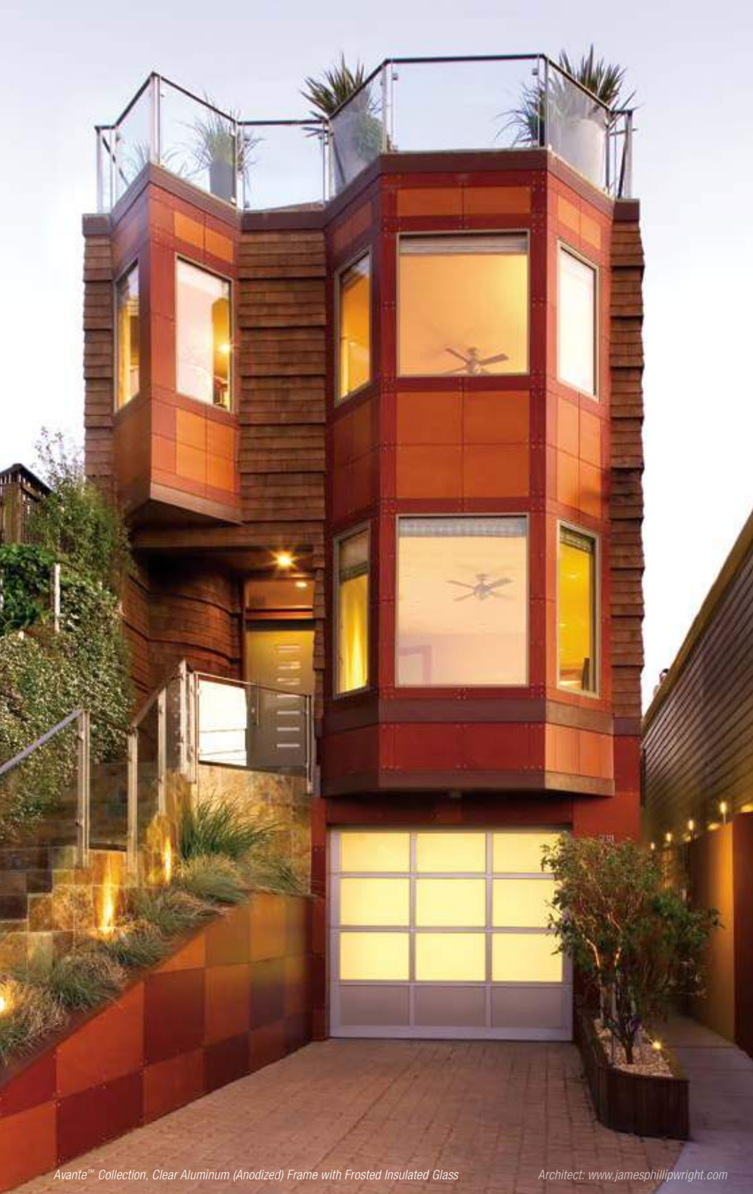
Avante™ Collection, Clear Aluminum (Anodized) Frame with Frosted Insulated Glass