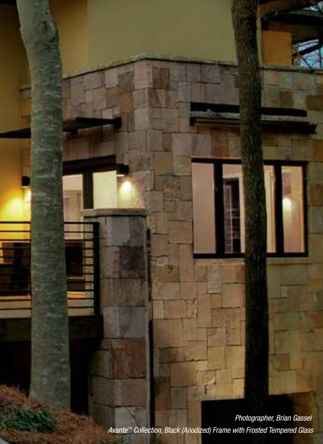
Avante™ Collection, Black (Anodized) Frame with Frosted Tempered Glass