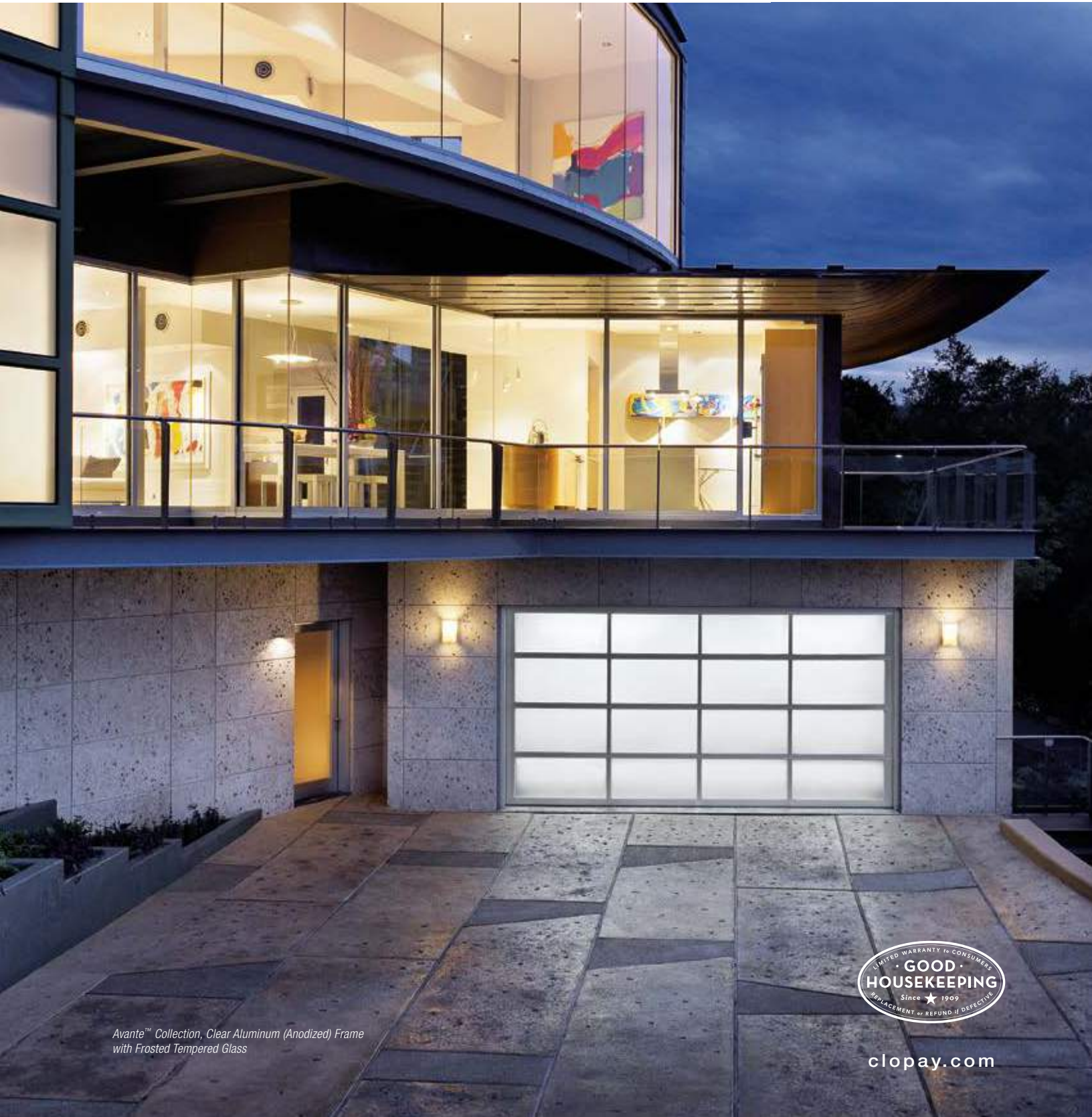
Avante™ Collection, Clear Aluminum (Anodized) Frame with Frosted Tempered Glass